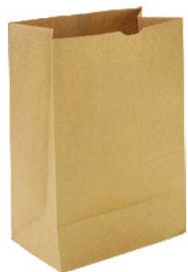
Container A 27 Cubes from a 3x3x3-inch cube

Mary bought a 3-inch by 3-inch by 3-inch, solid, unpainted cube and a 4-inch by 4-inch by 4-inch, solid, unpainted cube. She painted the 3 x 3 x 3-inch cube green and the 4 x 4 x 4-inch cube yellow. She then cut each of the cubes into 1-inch by 1-inch by 1-inch cubes. She then placed each of the 1-inch cubes from the 3-inch cube into brown paper bag A and each of the 1-inch cubes from the 4-inch container into another brown paper bag B.