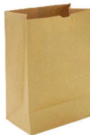
Container B 64 Cubes from a 4x4x4-inch cube

She decided to randomly select a cube from each container. Find the following probabilities: